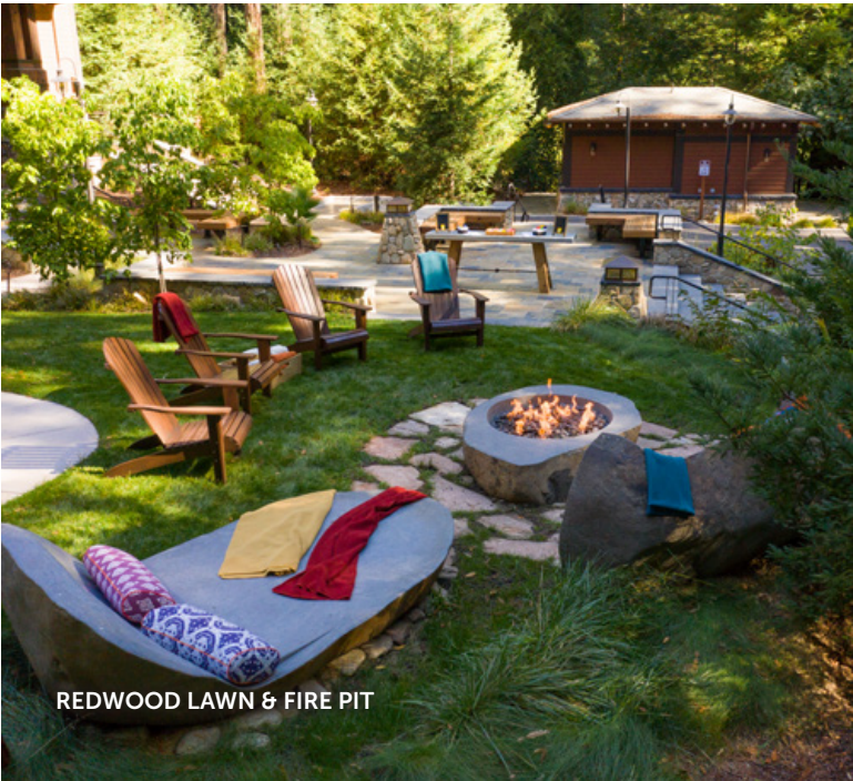
REDWOOD LAWN & FIRE PIT