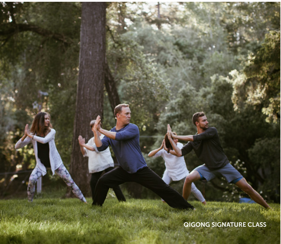
QIGONG SIGNATURE CLASS