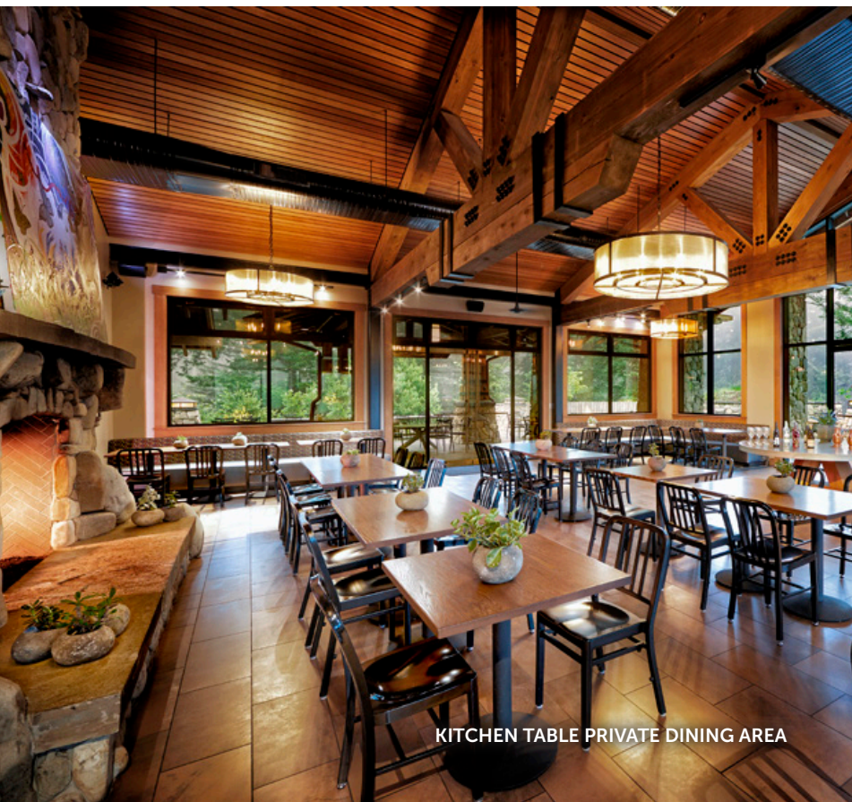
KITCHEN TABLE PRIVATE DINING AREA