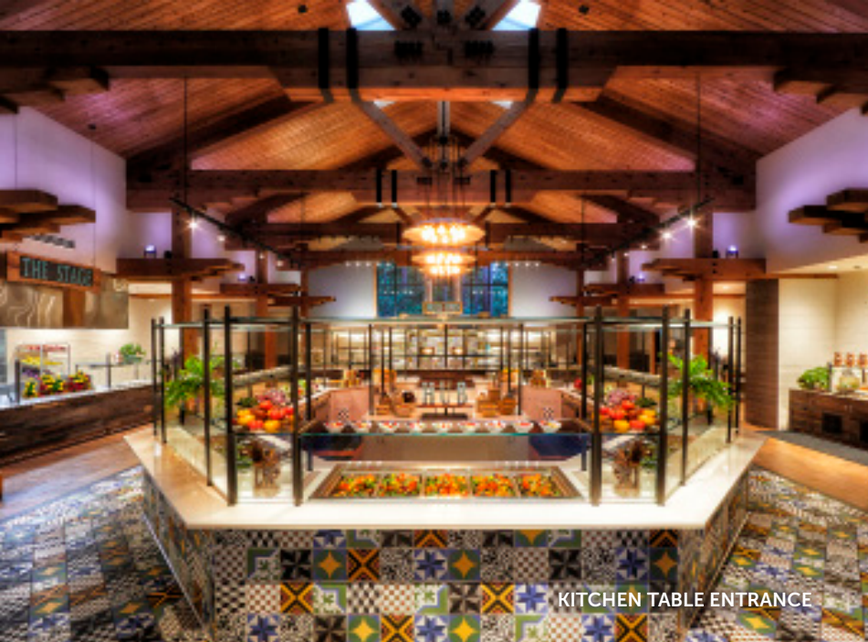
KITCHEN TABLE ENTRANCE